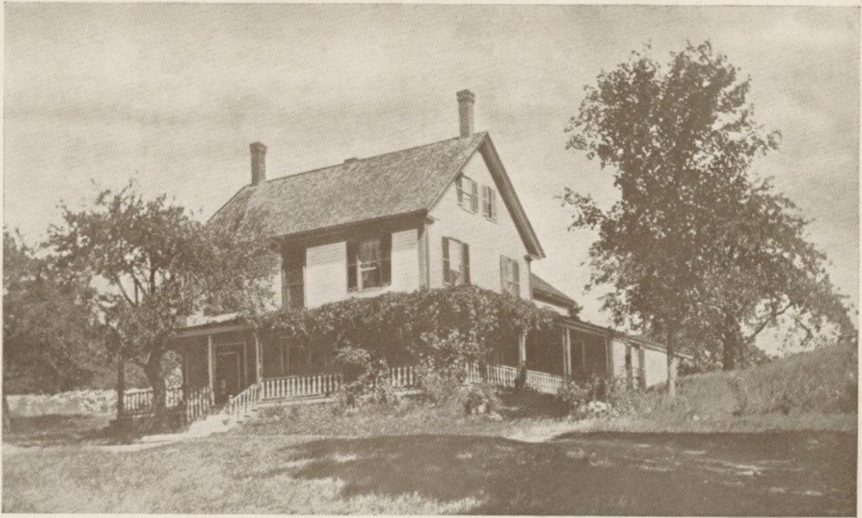
THE GURNET, MAINE. New Meadows River. Gurnet House.