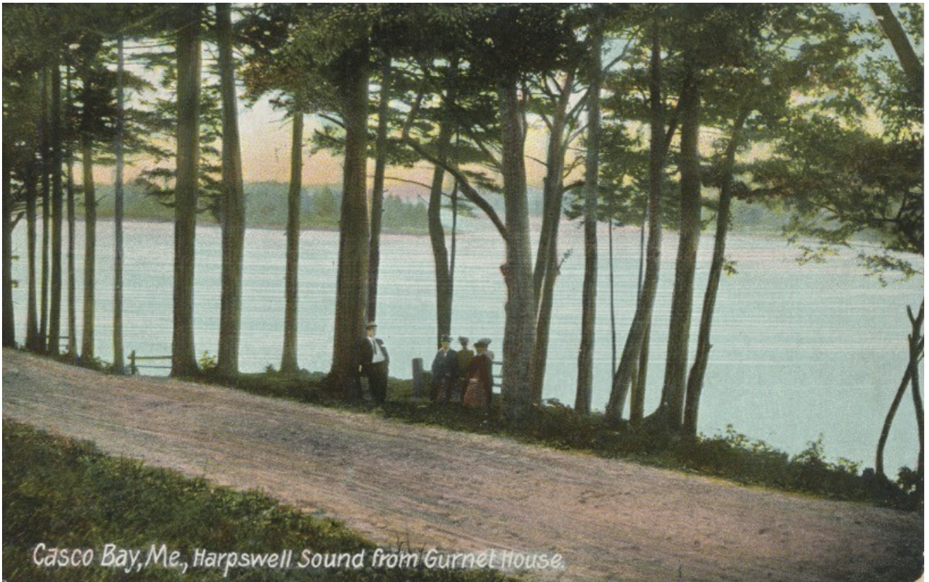
Casco Bay, Me., Harpswell Sound from Gurnet House.