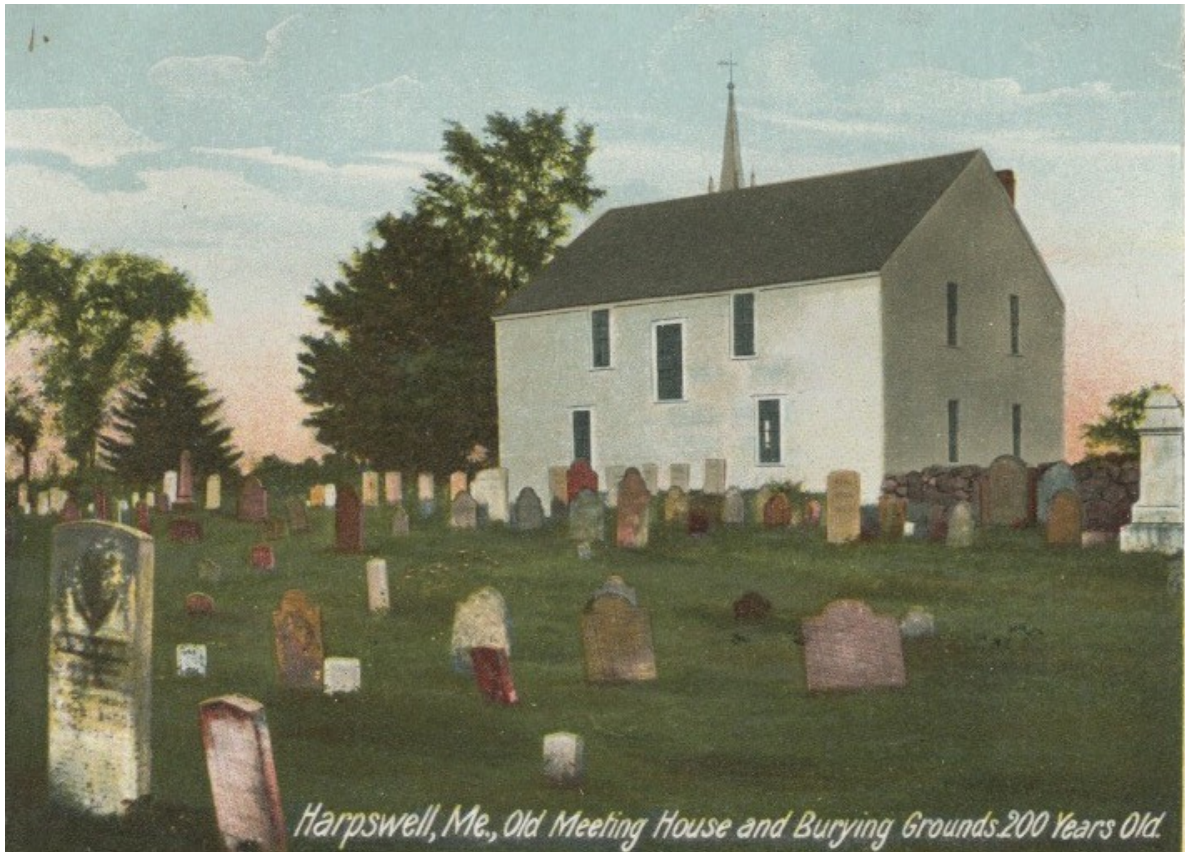
Harpwell, Me., Old Meeting House and Burying Grounds 200 Years Old.