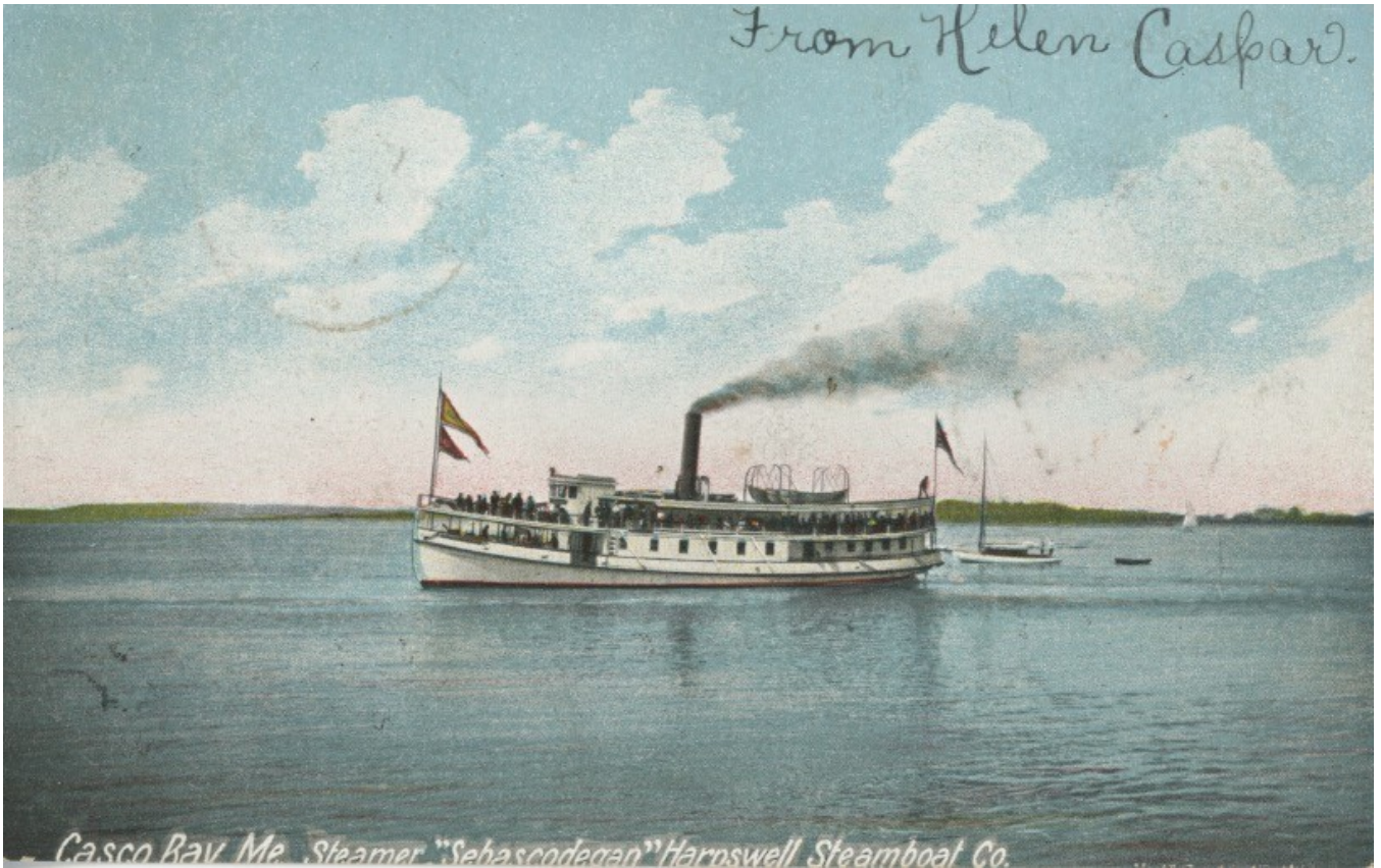
Casco Bay Me. Steamer "Sebascodegan" Harnswell Steamboat Co.