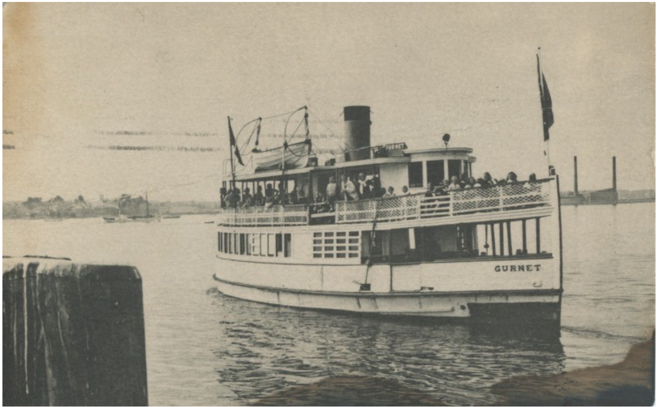
STEAMER GURNET, CASCO BAY, MAINE

Dear Ma: Am having a ride on this boat to-day. Believe is a bomb. trip. Some gone to Montreal so I don't know where we'll get out again. Will be home to-night Suppose I must go to work soon, but having a lot of fun playing board at all times