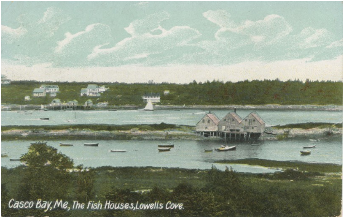
Casco Bay, Me., The Fish Houses, Lowells Cove.